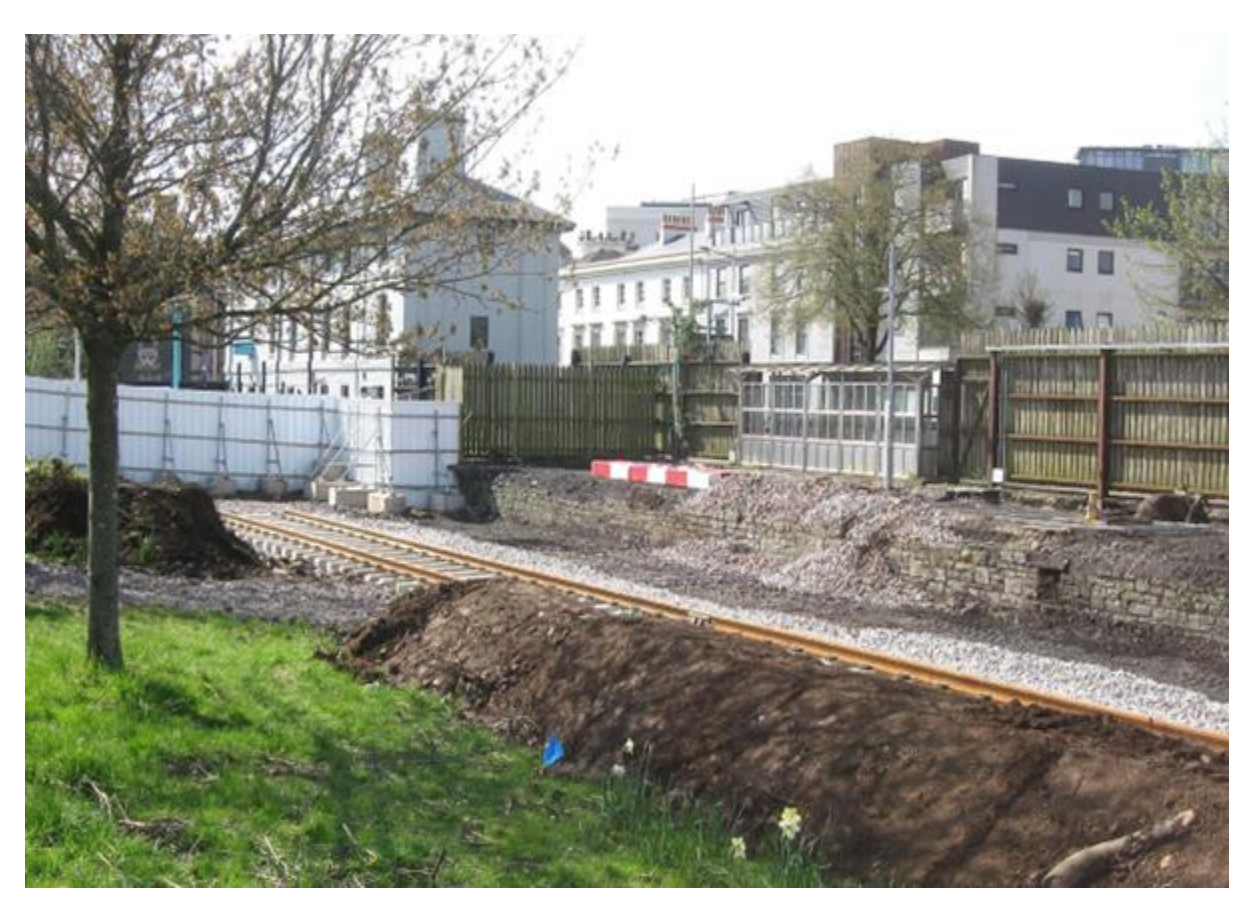
A view of the terminus of the Cardiff Bay branch in April2023 with the track laid for the new second platform. The existing single-track station is hidden behind the wooden fence.

Work is progressing on the upgrade of the one-mile-long single-track branch from Cardiff Queen Street to Cardiff Bay. This is part of the South Wales metro project and comprises the laying of double track, construction of a second platform at the branch terminus and the provision of a new station about half way along the branch. The line will no longer be operated as a shuttle from Queen Street but will have through tram trains from Pontypridd and potentially Treherbert, Merthyr and Aberdare.